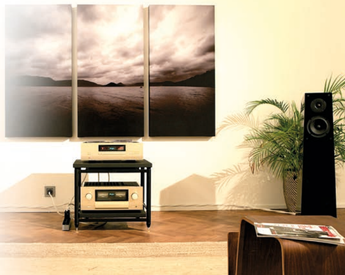
Image of 180x60cm, 120x60cm and 60x60cm models Ref.:MEL180, MEL120 and MEL060 (on the left) and three Ref.:MEL120 models applied (ambient image) with MOTIF® finishing.